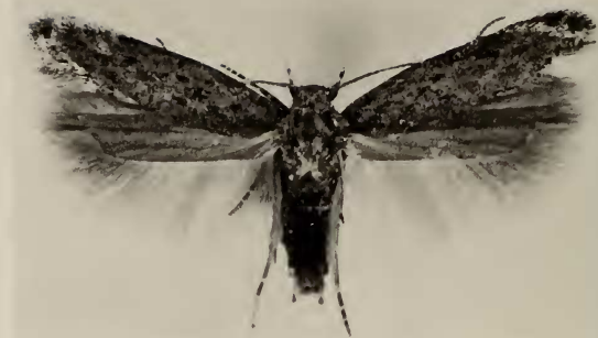
FIG. 1. Tildenia georgei , new species, paratype male.

reflections; femur pale yellow dorsally, becoming darker ventrally, all scales tipped with pale gray; tibia pale yellow basally and dorsally, mottled gray and pale yellow elsewhere, lateral spurs dark gray, scales narrowly margined with pale gray; tarsus mainly gray, apex of each tarsomere pale yellowish gray. Abdomen: Shining dark gray dorsally, distal row of scales on each segment paler than preceding scales; ventral surface pale yellowish gray medially, some mainly gray scales laterally. Male genitalia: As in Figs. 2, 4. Female genitalia: As in Fig. 7. Larva: Leaf miner on Physalis heterophylla var. ambigua (Gray) Rydberg.